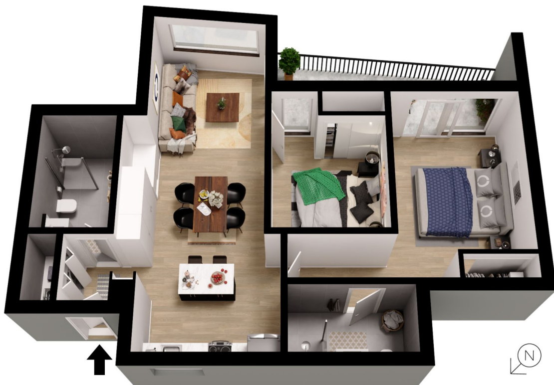
1104/10 PARK TERRACE, BOWDEN

Scale in metres. Indicative only. All information contained herein is obtained from source we believe to be accurate. We cannot guarantee its accuracy. Interested persons should make and rely on their own enquiries